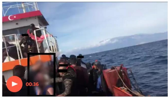
A Refugees 'abandoned' in life rafts after alleged 'pushback' by Greek coastguard – video

Lawsuit filed at European court of human rights says group were abandoned in life rafts after some were beaten