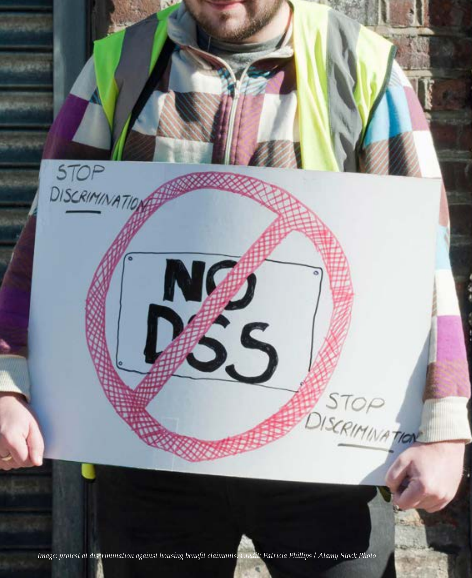
Image: protest at discrimination against housing benefit claimants.