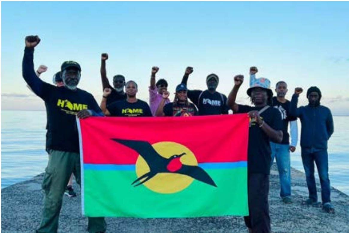
Barbuda Land Rights and Resources Committee.

The case greatly strengthens the ability of citizens to bring environmental protection cases, and hold governments and private entities to account, for adverse environmental, habitat and community impacts.