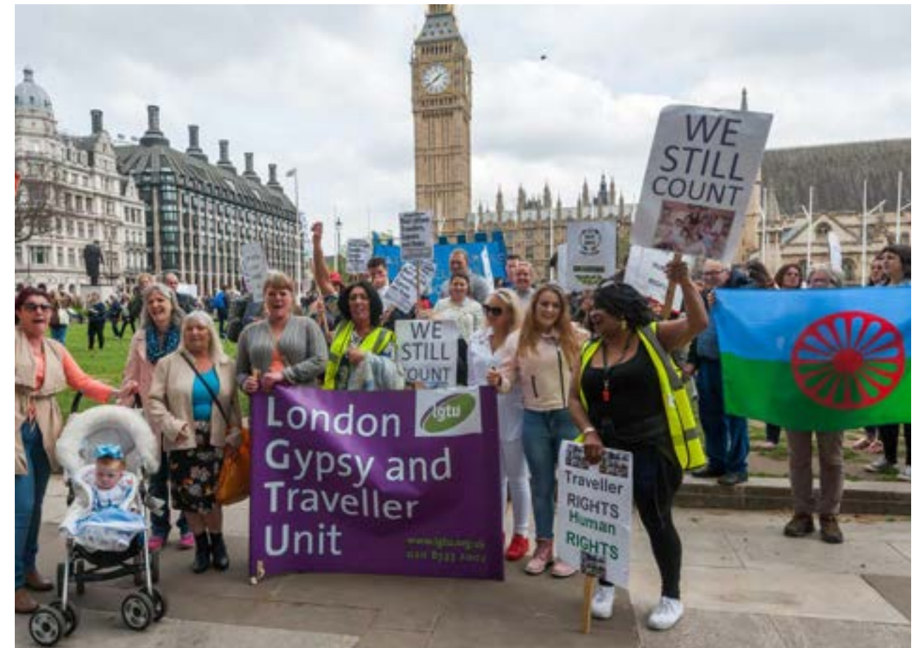
London Gypsy and Traveller Unit in parliament square. 21 May, 2016.

While the Supreme Court’s ruling authorised the use of such orders, they must be judiciously applied, with strict limitations on scope and duration, to ensure they are proportionate and justifiable. It also established specific safeguards protecting the rights of Gypsies and Travellers, underscoring the need for legal measures to consider the significant impacts on the lives of these communities.