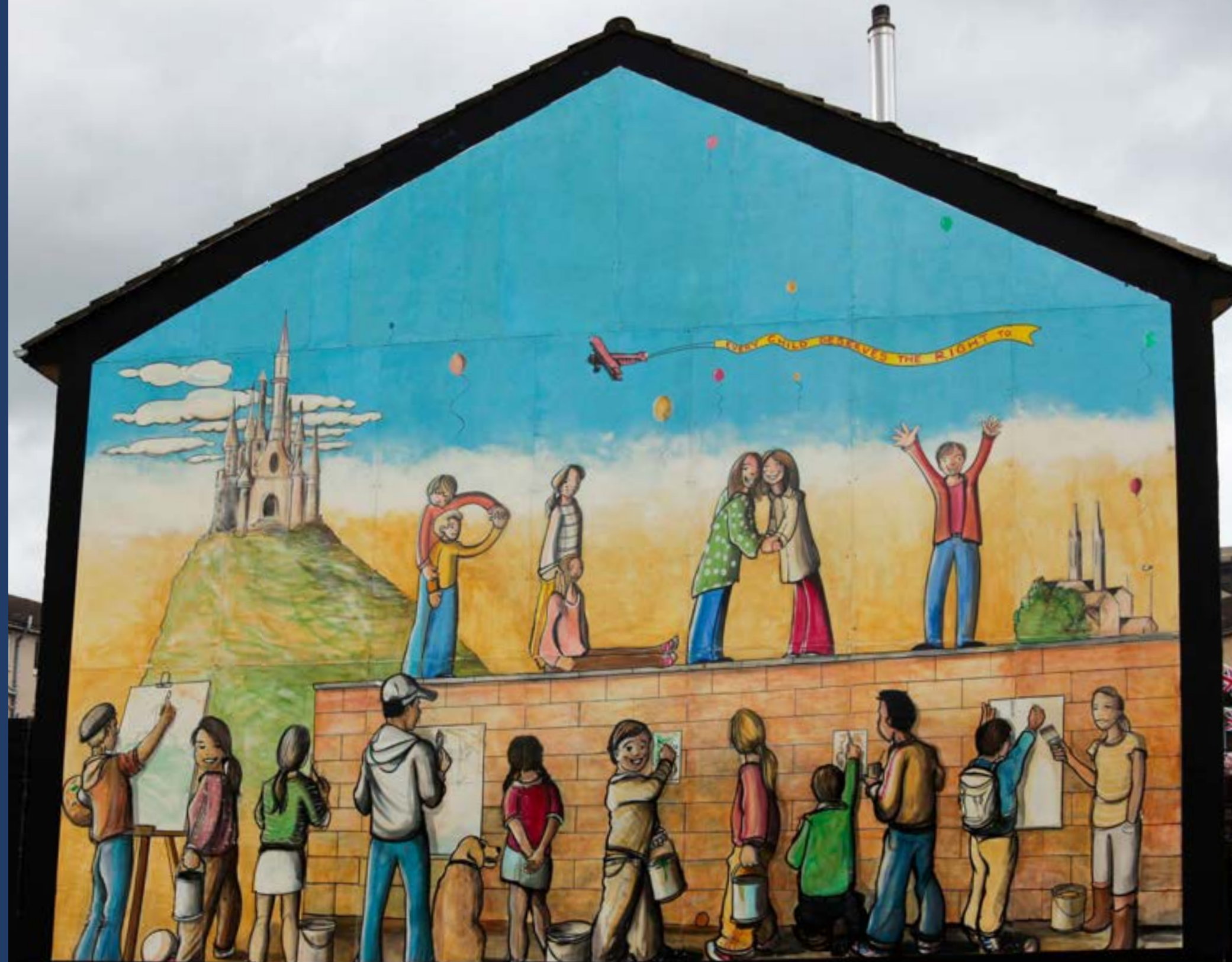
Belfast mural depicting children's right to play.