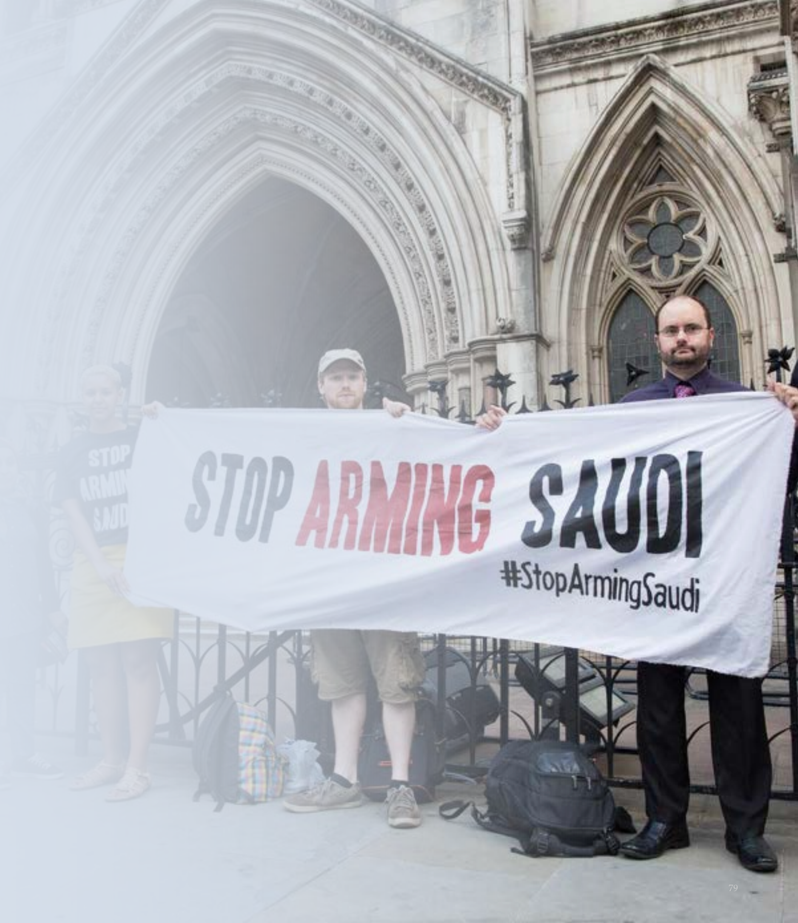
Image: Supporters of Campaign Against the Arms Trade stand outside the High Court.

Ziegler is a high-water mark in the protection of peaceful protest that is disruptive to others. The Supreme Court clarified that deliberate physically obstructive conduct by protesters could, in some circumstances, have a “lawful excuse” for the purposes of section 137, even if the impact on other highway users was more than minimal. An assessment of the facts in each individual case was necessary to determine whether the interference with the protesters’ rights, under Articles 10 and 11 of the European Convention on Human Rights, was proportionate. Determining proportionality requires assessing whether a fair balance was struck between protesters’ rights and community interests. This fact-specific inquiry includes considering the degree of obstruction, the nature of the protest, and any other offences committed. Significantly, the Supreme Court permitted consideration of the merits of the protest. It highlighted that trial courts should assess whether the issues prompting the protest are “very important”, thus attributing weight to them in the proportionality balance. Furthermore, the court emphasised the importance of tolerance for disruption to ordinary life, including traffic, resulting from the exercise of the Article 10/11 rights to freedom of expression and peaceful assembly.