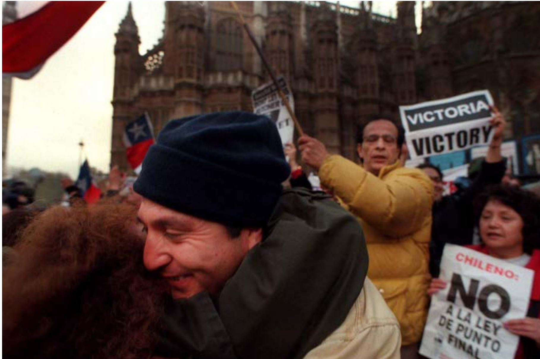
Jubilant protesters outside the Houses of Parliament, after hearing the news of the Lords vote on general Pinochet, 1988