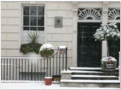
Garden Court's premises at Lincoln's Inn Fields, London, in the snow