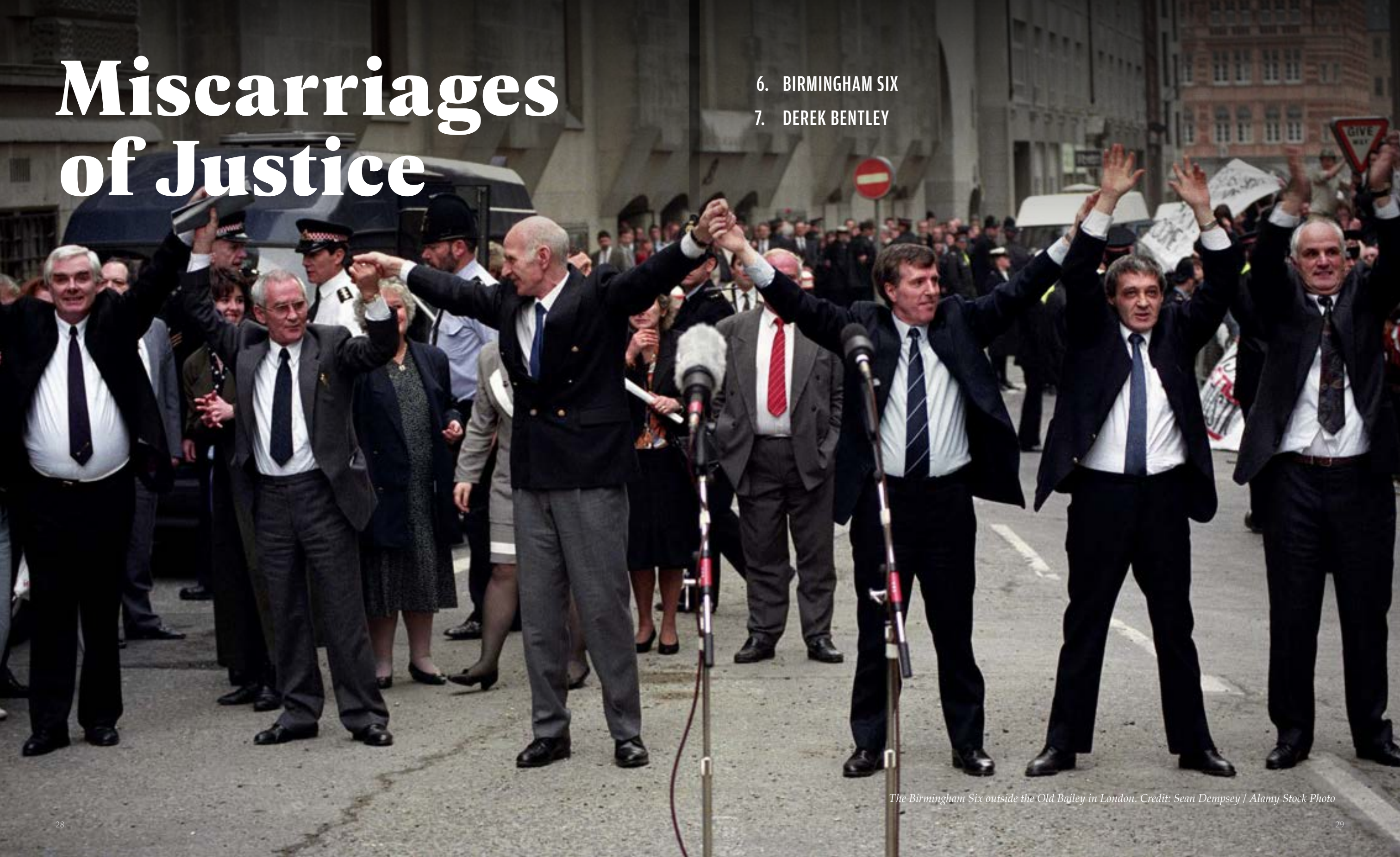
The Birmingham Six outside the Old Bailey in London.