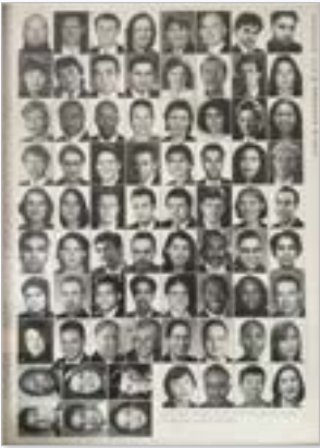
Collage of members created for Garden Court's move to Lincoln's Inn Fields in 2005