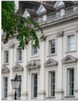
Garden Court's premises at Lincoln's Inn Fields, London