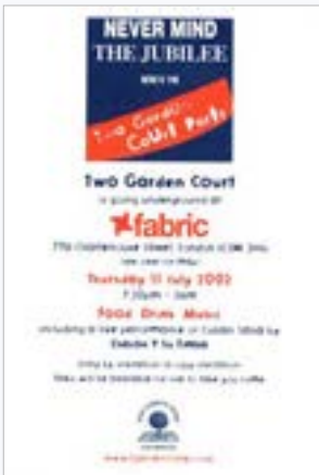
Invite for the legendary Garden Court party held at Fabric in 2002