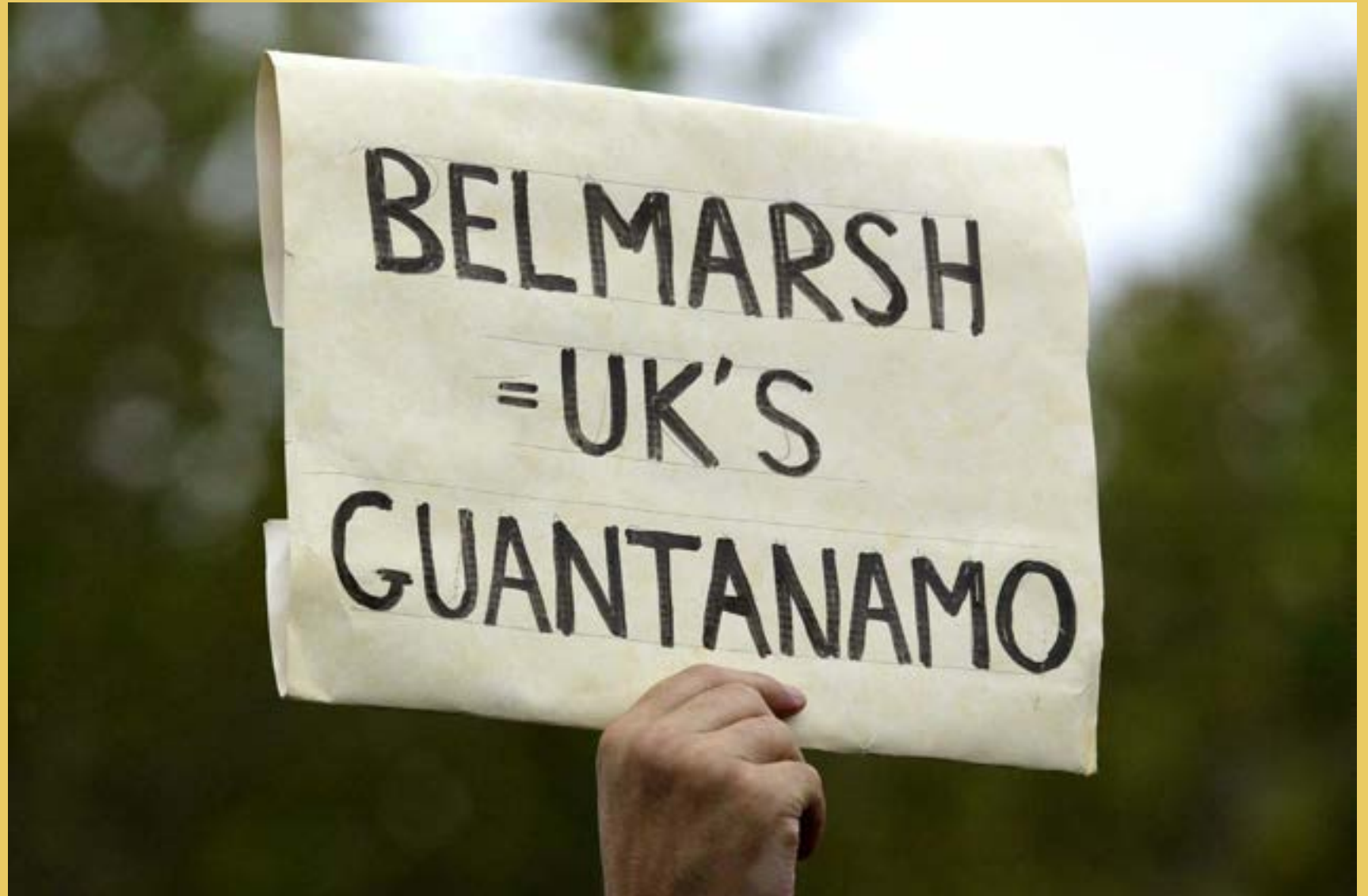
Human Rights and Civil Liberties activists gather at Belmarsh Prison in London