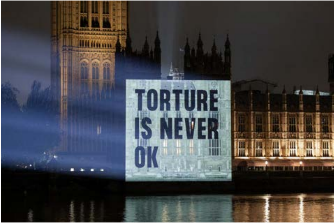
Freedom from Torture and the Survivors Speak OUT network campaign image, 2022.

Since its inception, members of Garden Court have played an important role in proceedings before the Commission, utilising the Chahal judgment to defend this most fundamental of human rights in expulsion, exclusion and deprivation of citizenship cases; and seeking to contest and expose the inequities inherent in the closed procedure.